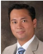
Interventional Spine/Physical Medicine and Rehab Interventional Spine Fellowship Faculty